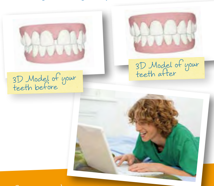
3D Model of your teeth before

Get started right away – ask your dental practitioner if Invisalign Teen is right for you!